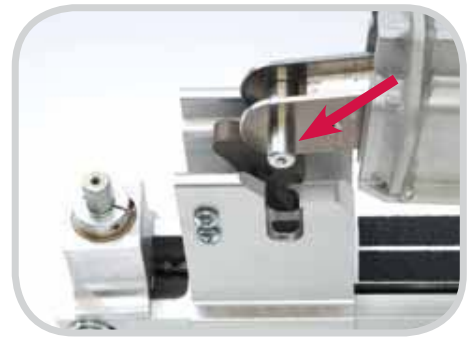
Align the clamp beam in the uprights

The top clamp beam can be removed quickly by simply depressing the quick release latch. Installing the top clamp beam is even easier – just align the clamp beam in the uprights and allow the beam to drop into position. Final clamping pressure is achieved with a few turns of the pivoting arm Acme threaded screw system for complete engagement of the clamp.